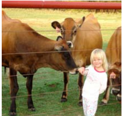
Twin Mountain's contented cows.