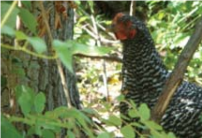
A happy pastured hen.